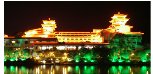
WWW.PARKHTL.COM PARK HOTEL