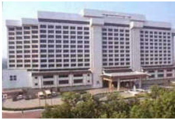
WWW.NEWWORLDHOTELS.COM GRAND NEW WORLD HOTEL