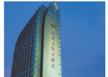
WWW.REDSTARHOTEL.COM RED STAR CULTURE HOTEL HANGZHOU