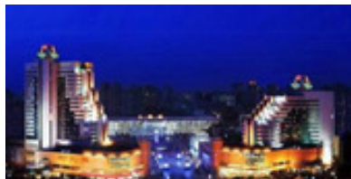
WWW.HOLIDAYINN.COM HOLIDAY INN DOWNTOWN SHANGHAI